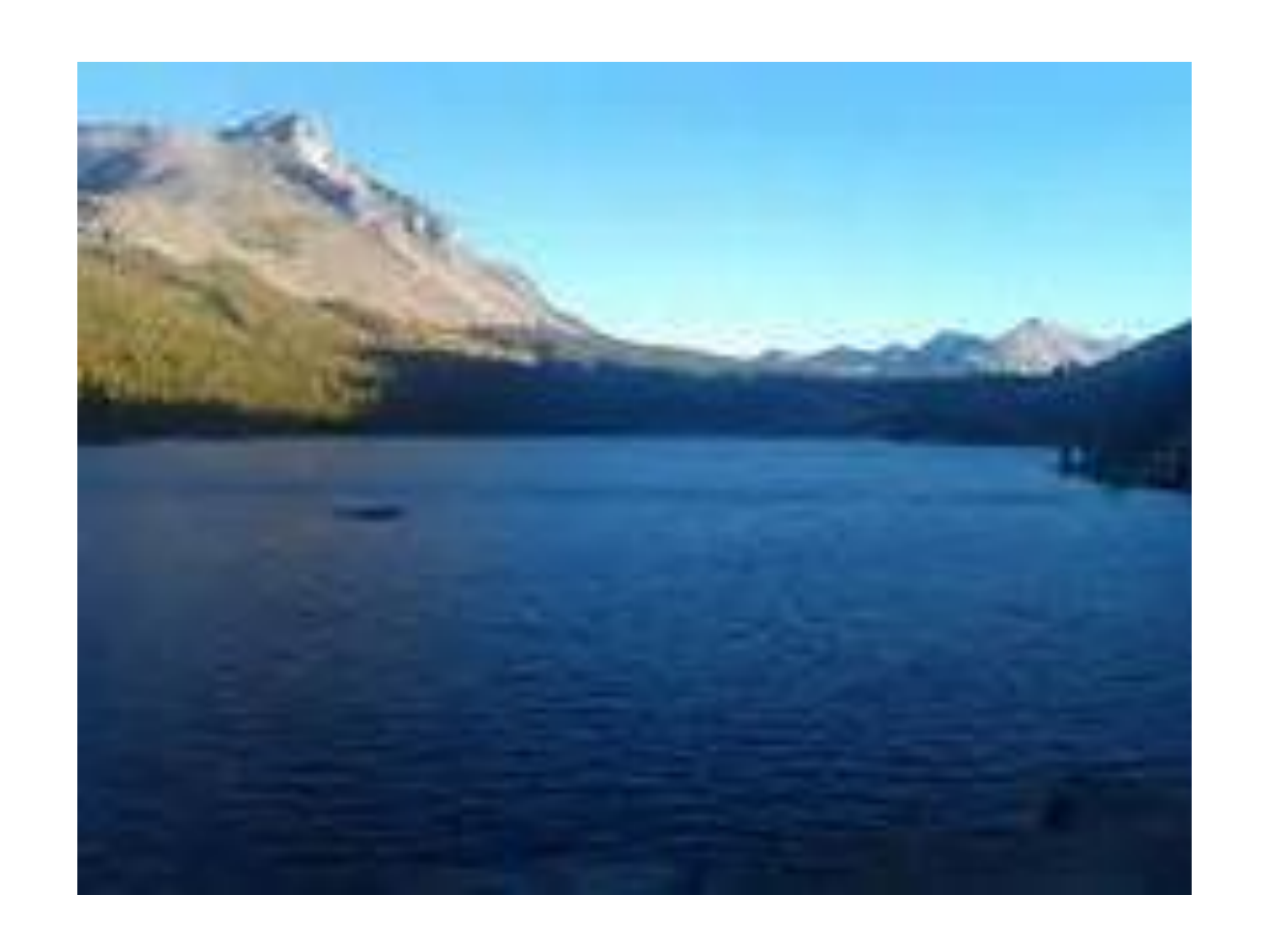
Mono Lake, California