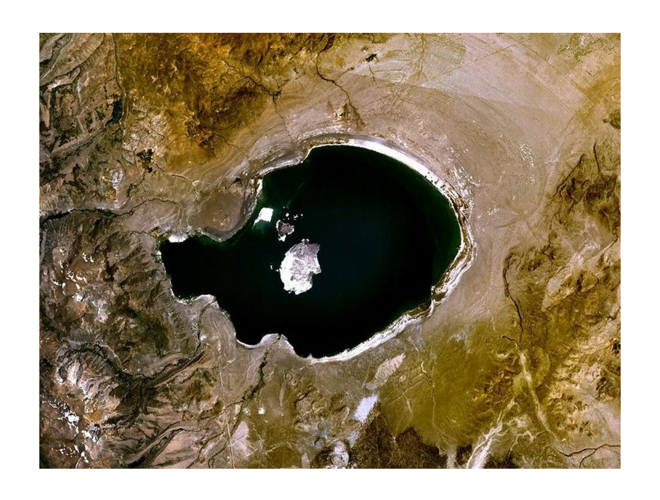
Significant drawdown due to LAW&P Diversions